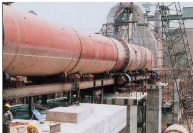
Erection of Kiln Shell in progress at Jayanthipuram.