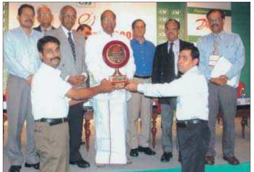
Excellent Energy Efficiency Shield, instituted by CII, awarded to Alathiyur unit being received from Shri Arcot N. Veerasamy, Hon'ble Minister for Power, Government of Tamil Nadu.